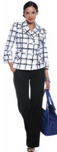
parent teacher conference